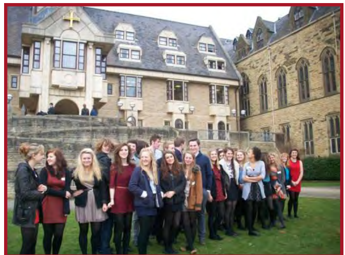
Sixth form students at Ampleforth College

Students were encouraged to dress up for the day. The students represented the school, as always, very well, and they received many favourable comments from both Ampleforth staff, and the university representatives.