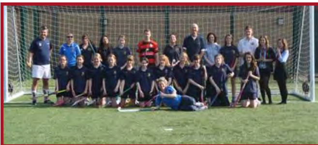
Staff and students line up at the hockey challenge game where the staff came out the winners, 5 goals to 0!

Well done to all those who took part in the staff vs Year 8 students, hockey match for Sport Relief. The staff put up a particularly impressive performance, winning 5 goals to 0.