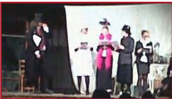
'Who killed the Mad Scientist?'

Teachers and students with only a handful of rehearsals clearly enjoyed the performance and it was interesting to see their untapped talents on display. A big thank you to the cast and audience for supporting the PTA in an enjoyable fundraising event which raised £421.00. Any funds raised by the PTA are going towards a new mini-bus to replace the old one.