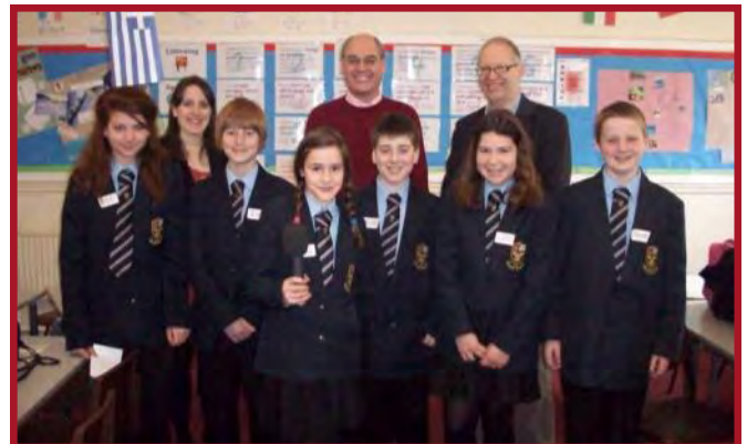
Students with the Honourable Simon Howard

The whole year group worked really hard on the project and there are definitely a few students to watch out for as the journalists of the future!