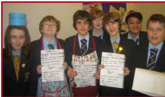
Year 8 students who enjoyed the French breakfast

Merci beaucoup to all the pupils who took part, especially to those who gave up a lunchtime to help out with the planning and organisation.