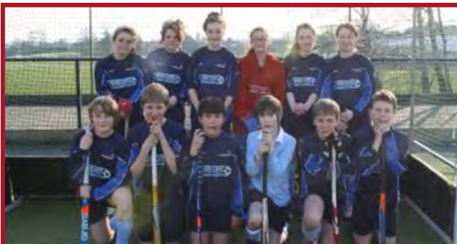
The U14 mixed hockey team line up for their team photo