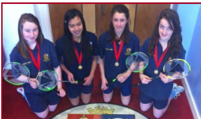
The KS3 girls badminton team who won the York District Badminton Tournament

On 29 February, Badminton teams from KS3 and KS4 girls and boys, travelled to York to take part in the York District Badminton Tournament. All teams played exceptionally well with our KS3 girls coming out the winners! They now proceed through to the Yorkshire Regional Finals, good luck girls!