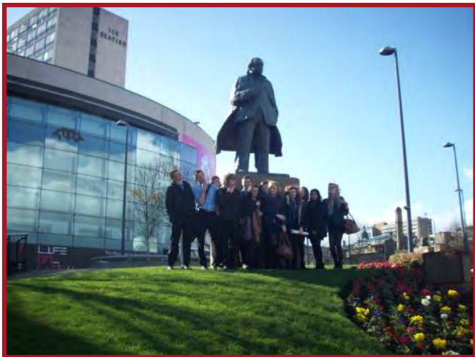
Students outside the Alhambra Theatre in Bradford, where they travelled to see the acclaimed production of 'An Inspector Calls' by Stephen Daldry

All the students thought it an excellent production, which had helped them in the lead up to their examination.