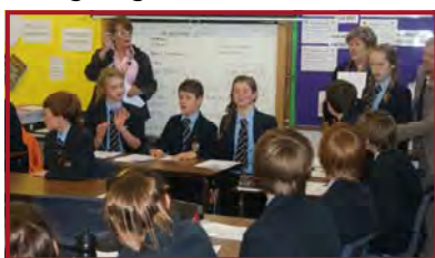
Students role playing with the magistrates