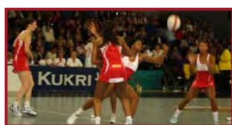
Students enjoying the play at the England Netball Game