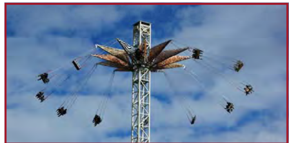
Students enjoying the thrills and spills at Flamingo Land

Students in Years 8 to 11 who had done well in their work last year were rewarded with a trip to Flamingo Land on 21 September. To qualify, students had to have gained fifty house points and not to have been in isolation. The whole day was a great success and all who went thoroughly enjoyed the experience. Those who did not qualify this time had a day of normal subject lessons.