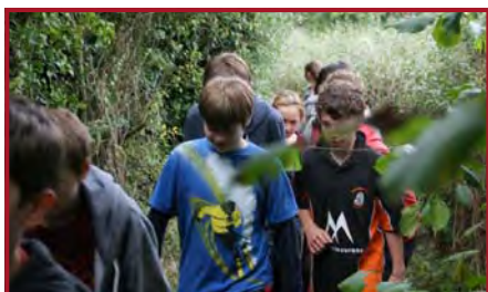
Sponsored Walk 2012

On Wednesday 10 October the whole school took part in a sponsored walk to raise money for the Music and Arts departments and a new mini-bus at school. The walk was well attended with students and staff enjoying the autumn sunshine. Our total at the moment is £4,433 with a further £1,796 to collect in. Our thanks go to all who helped with the organisation of the event.