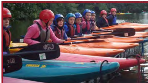
Year 7 students in action on their trip to Carlton Lodge

On Friday 21 September, whilst the rest of the school were at Flamingo Land, the Year 7 students enjoyed a day of activities at Carlton Lodge Outdoor Activity Centre near Thirsk. The students took part in various activities including archery, orienteering, problem solving, kayaking and raft building. A great day was had by all, even though the water was freezing!!