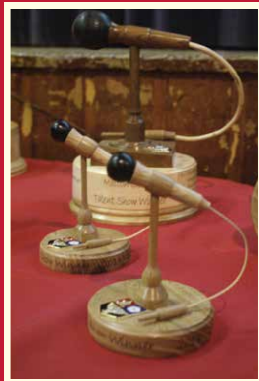
Talent Show trophy.