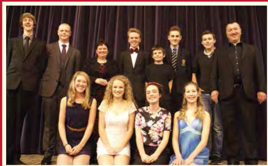
Presenters, organisers and performers on the night.