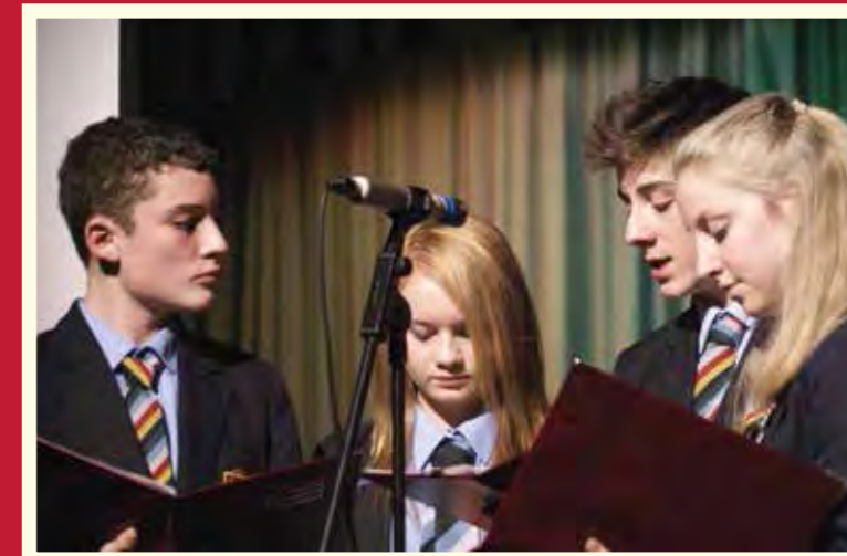
KS3 leaders presenting on the night.