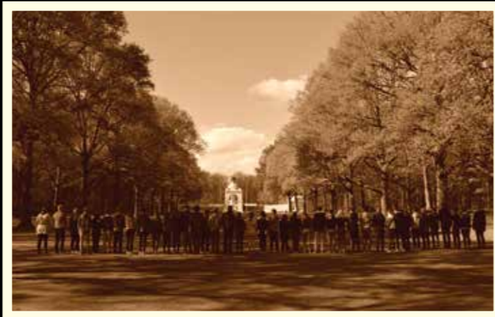
Students at Delville Wood, Somme.