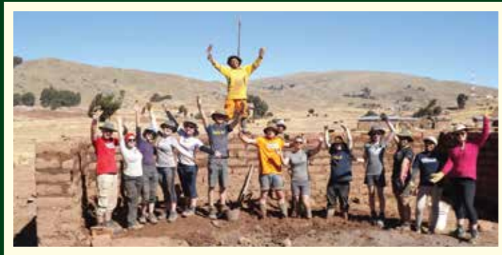
Students at Camps International Peru in 2016.

A group of intrepid students are preparing for an experience of a lifetime to Malawi next year. Students from the current Years 10 and 11 will spend four weeks in the central African country in July 2018, working on local community projects.