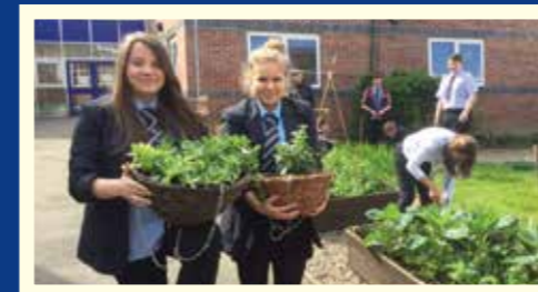
The gardening team planting up hanging baskets.

Green-fingered students have teamed up with Malton in Bloom to give the town a makeover in preparation for a national competition.