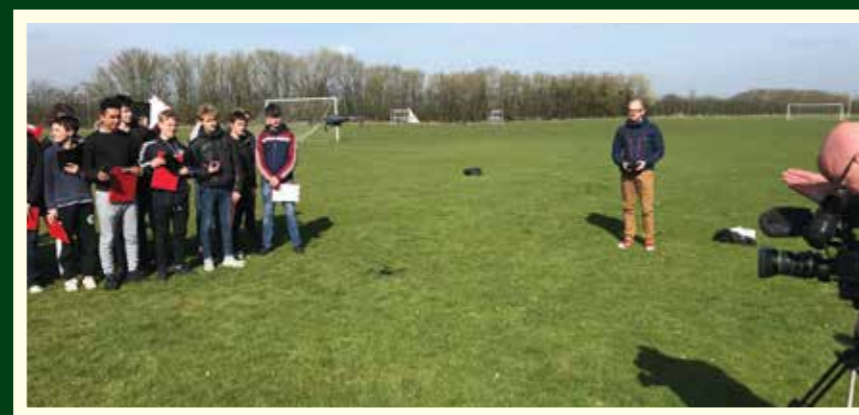
Year 10 students with the drone on the school field.

This exciting work was featured on BBC Look North. Each department in school is now being challenged to explore new applications of our iPad technology to further enhance the learning experience of the students.