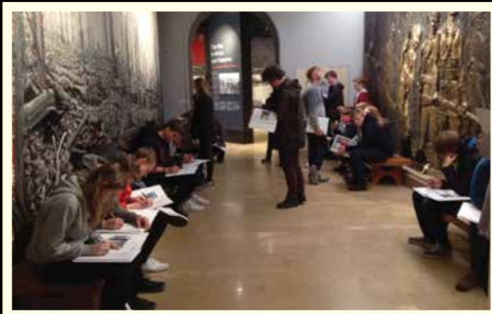
Students at the South African museum at Delville Wood, Somme.