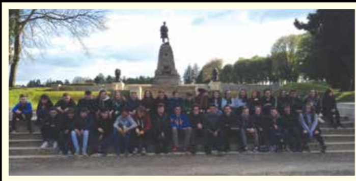
Students in front of the Gordon Highlanders memorial at Beaumont Hamel.

The itinerary saw the students visit the site of the famous Canadian victory of April 1917 at Vimy Ridge; the French national cemetery at Notre Dame de Lorette; the Arras Memorial to the Missing; the Ulster Tower; Thiepval Wood and the Thiepval Memorial to the Missing; Newfoundland Memorial Park at Beaumont-Hamel; the Historial de la Grande Guerre at Peronne; the Lochnagar Crater; the Welsh memorial at Mametz Wood and the South African memorial at Delville Wood; the German Cemetery at Fricourt; the Ploegsteert Memorial and the site of the 1914 Christmas Truce; Messines Ridge; Sanctuary Wood; the "In Flanders Fields" museum in Ypres; the 1917 cemeteries and memorials within Polygon Wood (part of the Passchendaele campaign); the German cemetery at Langemarck; and the largest British military cemetery in the world at Tyne Cot.