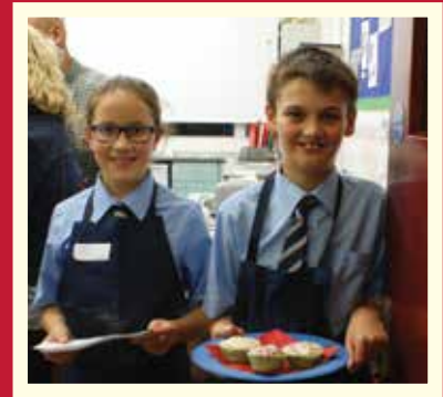
New starters helping at open evening.

The students were a great help at our open evening in September, assisting in various departments and welcoming visitors to the school. There was a great buzz about the place during the evening - thank you to our Year 7s and our older students who helped to make the evening a success.