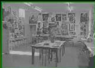
New Art Studios