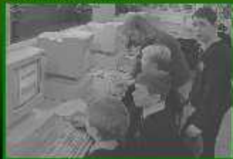
New ICT room