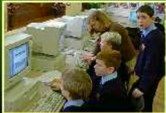
New ICT room