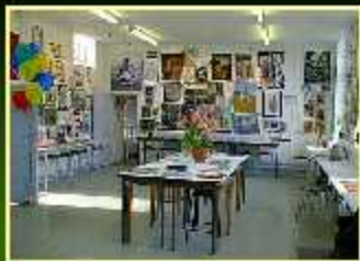
New Art Studios New ICT room